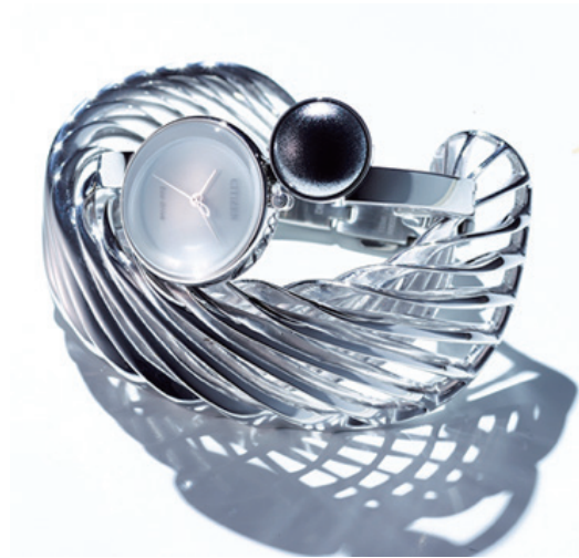
CITIZEN L Ambiluna Collection Limited Edition EW5499-54A USD 1,000 Autumn 2017