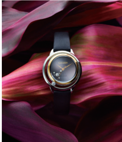
CITIZEN L Limited Edition (3,000pcs worldwide) EW5524-16E USD 1,040 Autumn 2017

CITIZEN is pleased to announce the release of two new models from CITIZEN L at Baselworld 2017. The first model is from the Ambiluna collection—in its second year, the new Ambiluna features a limited colour to the lacquer-made Urushi -drop and comes with a special bangle. The second model is playful yet elegant design with large diamonds.